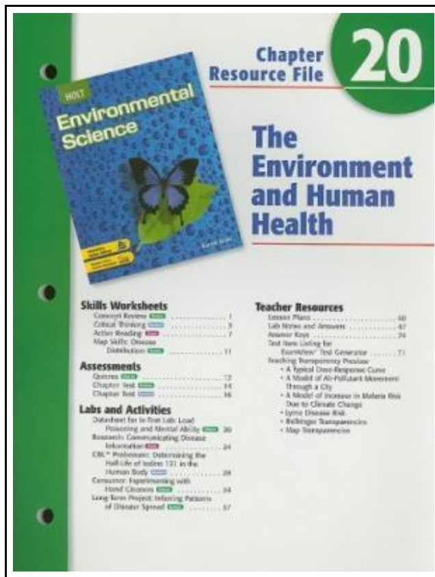
Filesize: 4.04 MB